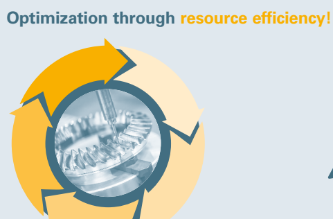
Resource efficiency wins!